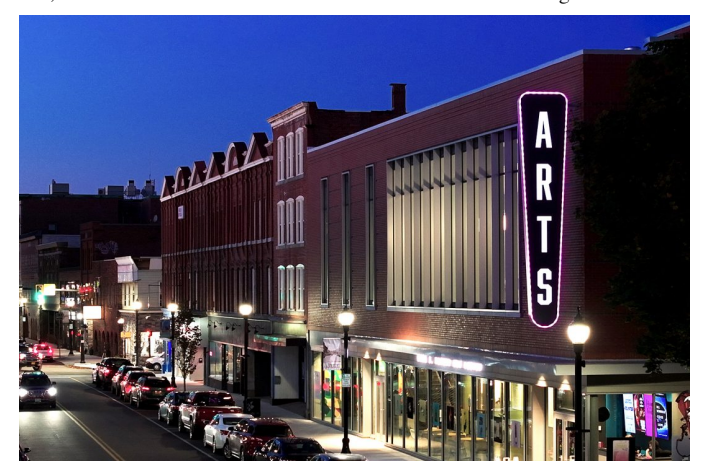
A Banner Year for the Arts