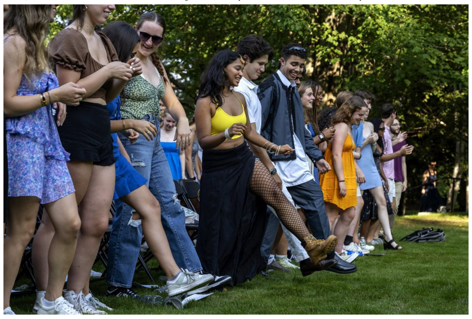
Members of the class of 2027 smile as they dance the "Hokey Pokey" during the College's 206th Convocation in September.