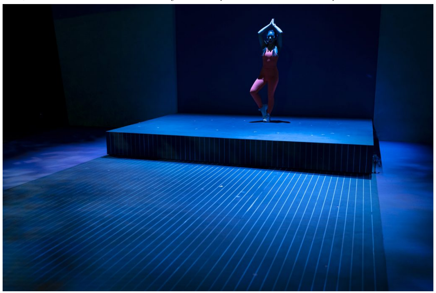
Steph Kwon '27 holds a pose.