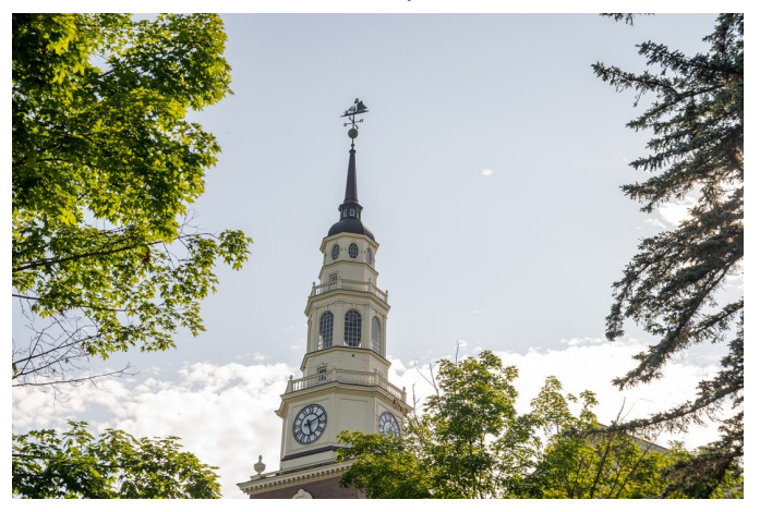
Colby Surpasses and Extends Dare Northward Campaign Goal