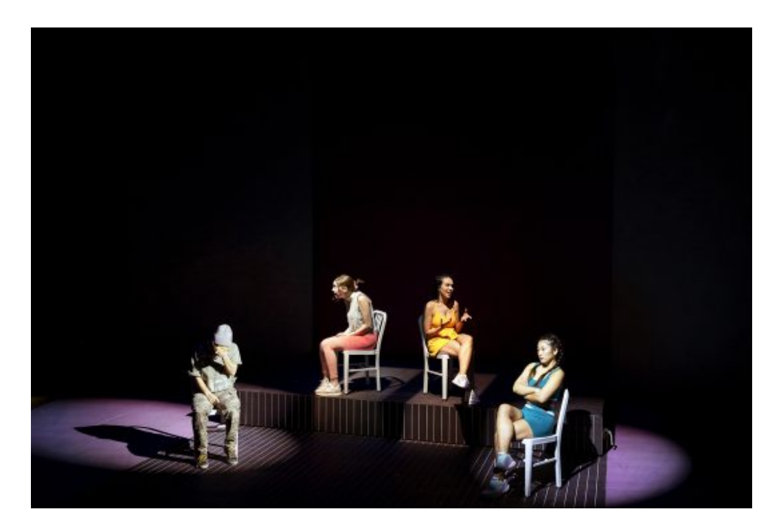
Actors explored themes of girlhood and play in Girls Just Wanna Have Fun.

"It has been amazing," he said. "To see how successful these events have been and how they have engaged a kind of campus-wide conversation—not only from students but also from faculty members—has given me a sense of accomplishment."